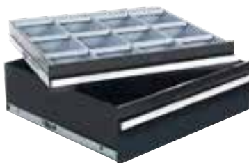
3" H & 6" H DRAWER OPTIONS Adjustable inserts and dividers included in each drawer.

Aluminum extruded drawer pulls with label area