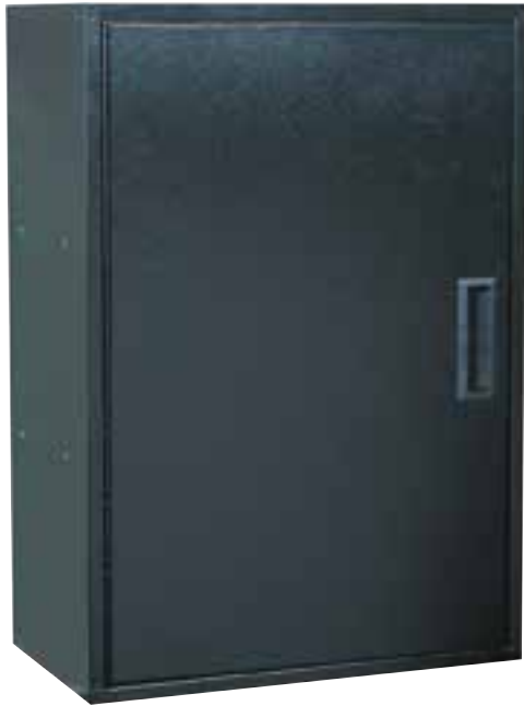
PL-UC1R-M 20.5" W x 12.5" D x 30" H Right or left opening door with two adjustable shelves

Full length piano hinges prevent door sag