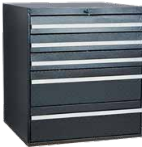
PL-BBK Knob Lock System 23½" W x 22" D x 26" H