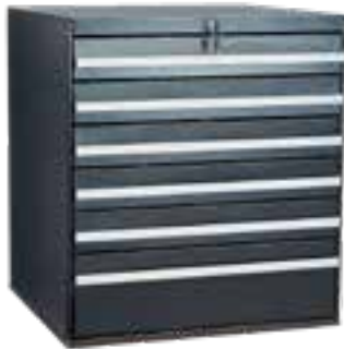
6 DRAWER CABINET PL-BBL-6R Drawer combinations (5) 3" (1) 6" drawers