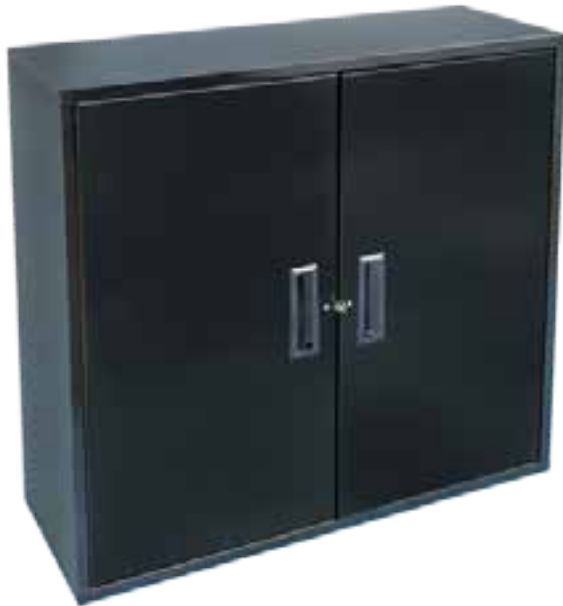
PL-UC2R 35.25" W x 12.5" D x 30" H Two adjustable shelves with handle option