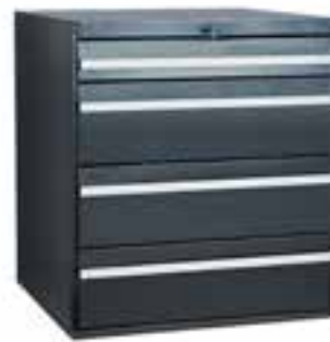
4 DRAWER CABINET PL-BBK-4R Drawer combinations (1) 3" (3) 6" drawers