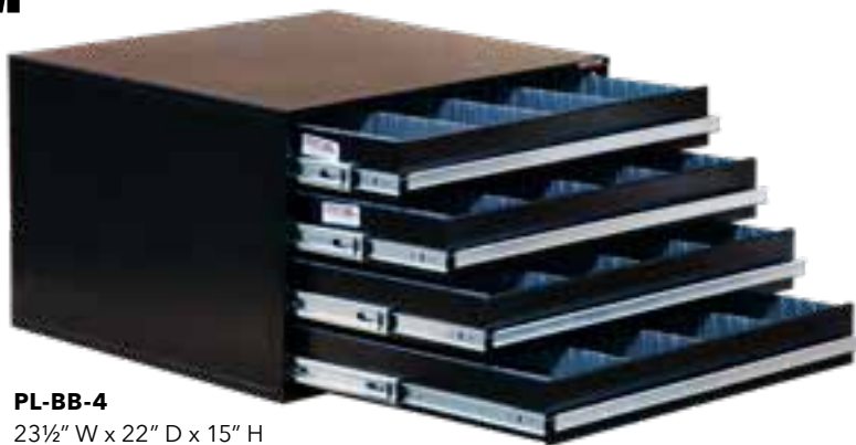
PL-BB-4 23½" W x 22" D x 15" H