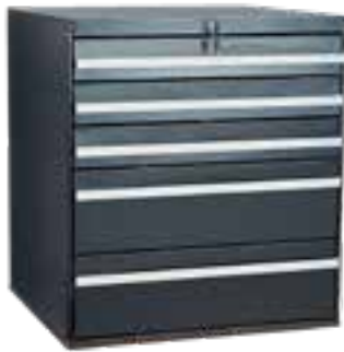
5 DRAWER CABINET PL-BBL-5R Drawer combinations (3) 3" (2) 6" drawers