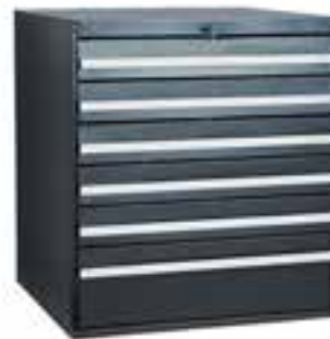
6 DRAWER CABINET PL-BBK-6R Drawer combinations (5) 3" (1) 6" drawers