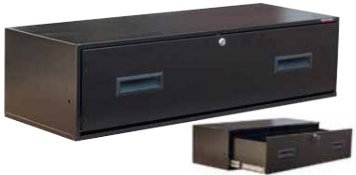
PL-9D 35.25" W x 12.5" D x 9" H Nine inch high ball bearing storage drawer