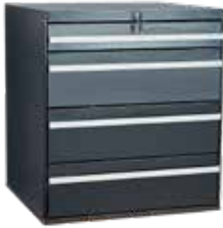
4 DRAWER CABINET PL-BBL-4R Drawer combinations (1) 3" (3) 6" drawers