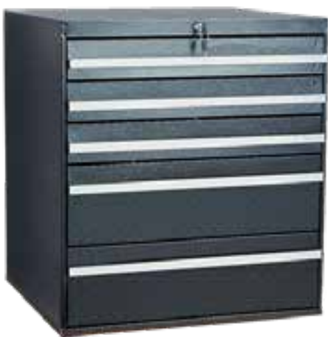
PL-BBL Key Lock System 23½" W x 22" D x 26" H