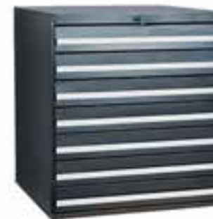
7 DRAWER CABINET PL-BBK-7R Drawer combinations (7) 3" drawers