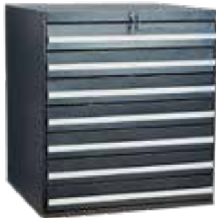
7 DRAWER CABINET PL-BBL-7R Drawer combinations (7) 3" drawers