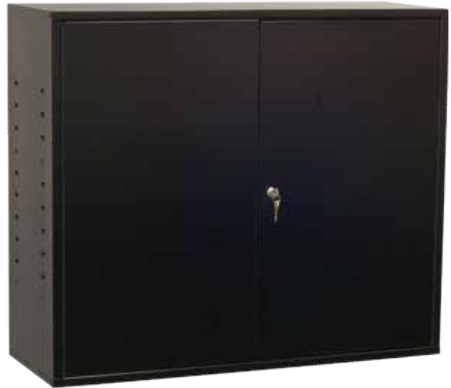
PL-UC2R-L2 35.25" W x 12.5" D x 30" H Two adjustable shelves with key lock option